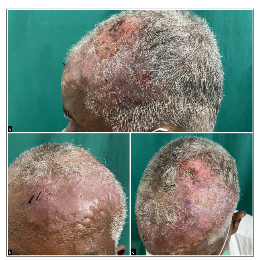
Figure 1a-c: Erythematous, indurated plaque of size 10 \times 8 cm with central ulceration over the frontoparietal scalp, multiple smaller skin-colored plaques along the border.

A 58-year-old male farmer presented to our clinic with a red plaque with ulceration and oozing for 4 months. The patient noticed a red lesion over the scalp after a local trauma, which gradually progressed to result in an erythematous, indurated plaque of size 10 \times 8 cm over the frontoparietal scalp [Figure 1] during the next 4 months. There were multiple smaller, skin-