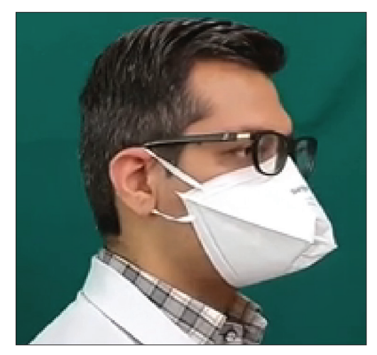
Video 2: Conversion of overhead mask to earloop mask.

Patient's consent is not required as there are no patients in this study.