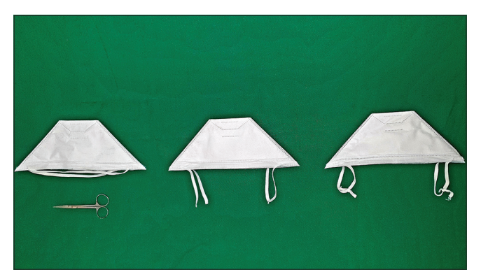
Figure 2: Conversion of overhead mask to earloop mask.