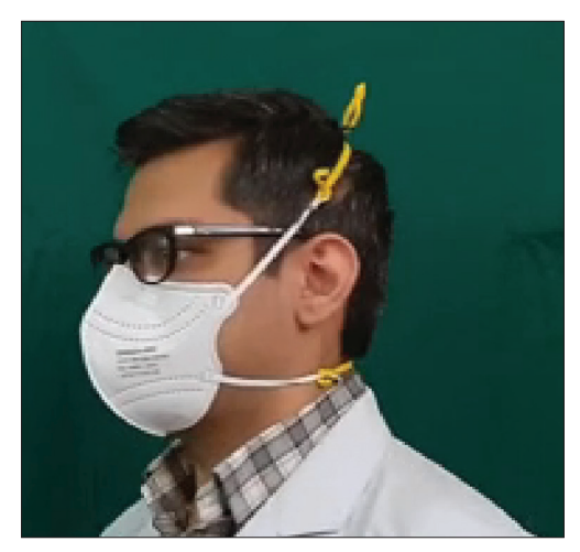
Video 1: Conversion of earloop mask to overhead mask.

itself at the back of the head as per comfort. Alternatively, the beaded elastic of a used overhead mask can be used. Masks should not be reused but their elastic pieces can be reused. The resultant overhead mask gives a snug fit without any pressure on the ears. To convert an overhead mask into earloop mask, cut its elastic bands in the middle and tie upper and lower ends of each side [Figure 2 and Video 2]. The resultant earloop masks do not cause any pressure at the back of the head and less pressure at the nose.