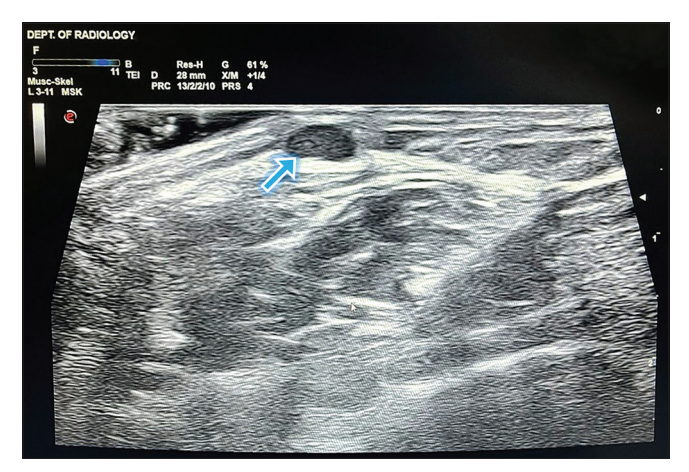
Figure 2: Hypoechoic lesion in the dermal plane (Blue arrow) corresponding to the fat lobule.

PPP is primarily clinical, and carrying out a biopsy for histopathological study is almost never recommended. However, an ultrasound imaging may be helpful in less obvious cases as a non-invasive tool. Behavioral modifications, weight reduction, and footwear optimization are some of the usually recommended treatment modalities.<sup>[2]</sup>