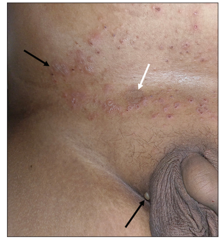
Figure 1: Multiple flaccid fluid-filled vesicles and bulla in the lower abdomen and groin (Black arrows). A single scaly annular plaque with central clearing (white arrow).

Various clinical presentations of cutaneous dermatophytosis are verrucous, plaque, eczematous, crusted, herpetic, and subcutaneous nodular (Majocchi's granuloma) type. Bullous dermatophytosis is an uncommon clinical presentation that is most often caused by Trichophyton