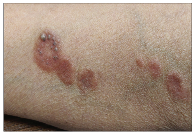
Figure 1: Erythematous papules and annular plaques with open comedones overlying the largest plaque.

Skin biopsy showed a palisading granuloma in reticular dermis around focus of fibrin and mucin deposition and incomplete collagen degeneration. Dilated follicular infundibulum filled with keratinous material corresponding to a comedo was seen [Figure 3].