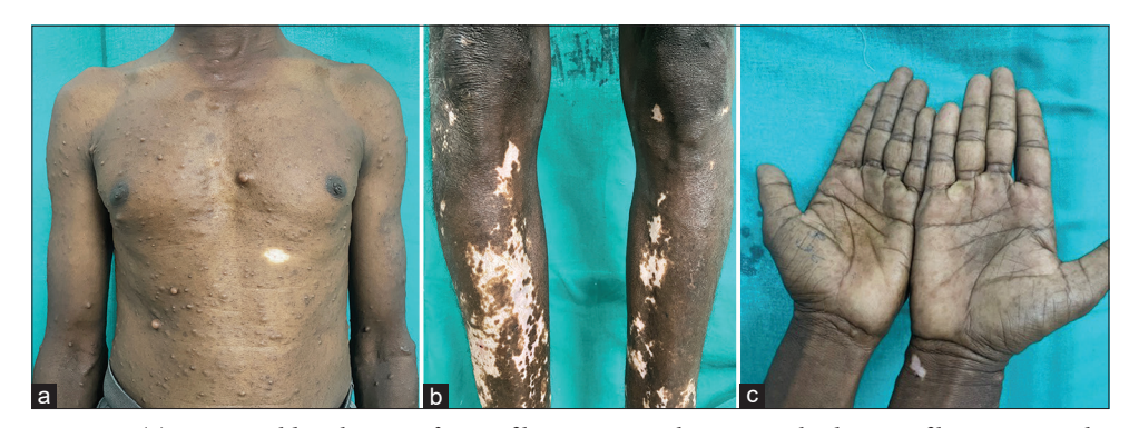
Figure 1: (a) 47-year-old male case of neurofibromatosis 1 showing multiple neurofibromas over the trunk and a single depigmented macule over the upper abdomen. (b) Multiple depigmented macules over the bilateral legs. (c) Palmar freckling with single depigmented macule over the right wrist.

A 47-year-old male case of NF1 presented with hypopigmented to depigmented patches all over the body for the past 2 years. There is no family history suggestive of NF and hypopigmented lesions. On clinical examination, axillary freckling, palmar freckling, and multiple well-defined light brown macules consistent with café-au-lait macules were present. Multiple soft, sessile, and pedunculated, dome-shaped, papulonodular lesions ranging from 1 mm to 15 mm in size distributed all over the body suggestive of neurofibromas. Ophthalmological examination revealed Lisch nodules. Multiple, well-defined, depigmented macules of size ranging from 0.1 cm to 10 cm over the right forearm, abdomen, and bilateral legs were present [Figure 1a-c]. Dermatoscopy of the depigmented macules showed a white glow with a starburst pattern, perifollicular pigmentation, trichome sign, and tapioca sago appearance [Figure 2a and b]. A diagnosis of NF1 with the coexistence of vitiligo was made. The patient was treated with topical clobetasol ointment and soaked PUVASOL for vitiligo vulgaris.