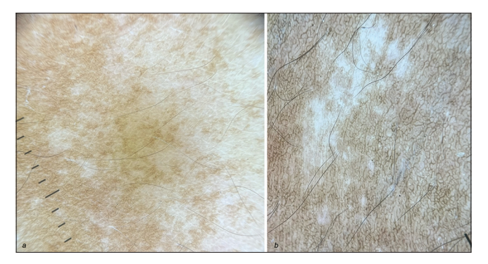
Figure 2: (a) Dermoscopy of the larger hypopigmented patch revealed a subtle broken pigment network with feathery margins suggestive of nevus depigmentosus. DermLite 4, Polarized mode, Magnification ×10. (b) Dermoscopy of smaller hypopigmented lesions showing diffuse whitish irregular area without scales suggestive of ash-leaf macules. DermLite 4, Polarized mode, Magnification ×10.

using criteria established by Coup in 1976. [2] The criteria include leukoderma present at birth or appearing early in life, no change in the distribution of leukoderma throughout life, no alteration in texture or sensation in the affected area, and the absence of a hyperpigmented border.<sup>[2]</sup> Complete pigment loss with irregular, ill-defined margins and no perifollicular pigmentation suggest ash-leaf macules whereas perifollicular pigmentation, a subtle reticular pigment network, and diffuse whitish areas with serrated borders (pseudopods) suggest ND [Table 2].[3] In the index case, dermoscopy helped in the differentiation of ash-leaf macule and ND. In Ash leaf macules, histopathology shows fewer and smaller melanosomes, often aggregating in keratinocytes. In ND, melanosomes are normal in size, shape, and melanin content but fewer in number,