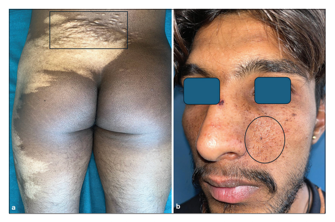
Figure 1: (a) A single, large hypopigmented patch with feathery margins over the trunk extending from left waist to buttock and thigh suggestive of segmental nevus depigmentosus, with an irregular thickened lesion suggestive of shagreen patch (box). (b) Multiple small reddish brown papules over the centrofacial region suggestive of angiofibromas (circle).