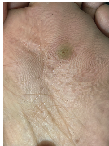
Figure 1: Solitary hyperkeratotic papule of the forefoot.

Plantar warts, or verrucae plantaris, are hyperkeratotic papules caused by HPV, predominantly types 1, 2, 4, and 63. These warts often cause significant pain and can impede walking. Dermoscopy significantly enhances the diagnostic accuracy of plantar warts by revealing specific morphological features not visible to the naked eye. The presence of black dots and globules, dotted and linear vessels, frogspawn or falooda seed appearance, and interrupted dermatoglyphics are highly indicative of warts. [1] These features help differentiate warts from other benign (corns, calluses), and malignant lesions (squamous cell carcinoma). Corns and calluses typically show a central core with intact dermatoglyphics and lack thrombosed capillaries. Squamous cell carcinoma may present with a similar hyperkeratotic appearance but lacks the characteristic black dots and