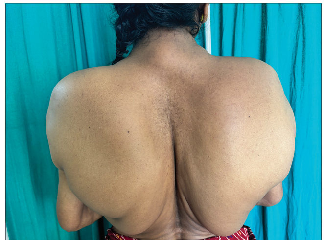
Figure 4: Abnormal deposition of fat over the scapula.