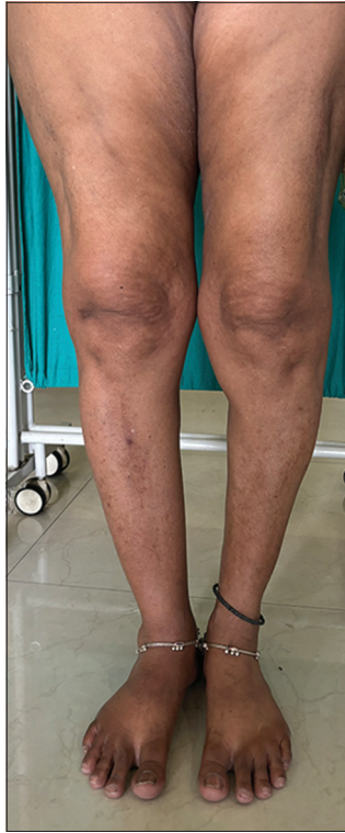
Figure 5: Normal distribution of fat over bilateral lower limb.