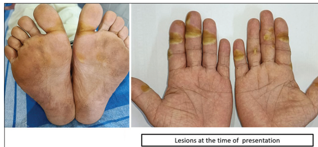
Figure 1: Multiple yellowish-white, tender, and tense bullae present over the palmoplantar region.

On examination, yellowish-white, desquamating lesions along with tender and tense bullae were present involving the palmar and plantar regions, which were consistent with blistering distal dactylitis (BDD) [1] [Figure 1]. The patient was, then, advised for pus culture which showed Methicillin-sensitive Staphylococcus aureus growth and the patient was started on oral antibiotics (Cefixime 200 mg twice daily and clobetasol ointment once daily application) for a week and a diagnosis of BDD was made. The patient was advised to discontinue pazopanib. The patient was reviewed after seven days and the skin lesions had resolved [Figure 2].