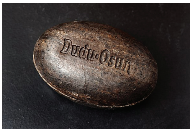
Figure 2: African black soap “Dudu-Osun.”

manufacturing mild and moisturizing cleansers. There are two types of surfactants – natural and synthetic. Natural surfactants were used in the manufacture of traditional soaps, transparent bars, super-fatted soaps, and combars. Whereas synthetic surfactants were used in the manufacture of syndet bars. It was well established that syndet bars have significantly less irritant potential compared to soap with natural surfactants. The present day syndet bars employ milder surfactants such as sodium cocoyl isethionate and glycinate in manufacturing to reduce the irritation and emollients such as oils, glycerin, and petrolatum for moisturization. Liquid body washes are very popular for their convenience in dispensing and hygiene. They deliver greater emollient deposition than soap or syndet bars. Facial cleansers are specifically curated for the health of facial skin sometimes with anti-aging benefits. They are different from liquid body cleanser by containing milder and costlier surfactants and lesser emollients to avoid the heavy “after-use feel.” [5]