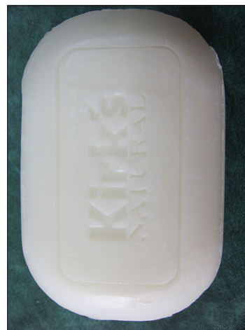
Figure 1: A bar of Castile soap.

Even though soap was initially expected to deliver only cleansing benefits, consumer expectations came with time to deliver health and cosmetic benefits. Surface—active substance (Surfactant) is the principal ingredient in a cleanser which is responsible for foaming and cleansing. Surfactant’s ability to lower the surface tension is because of its unique structure with hydrophobic and hydrophilic ends. Surfactant is also responsible for the damage to the stratum corneum (SC) causing dryness, irritation, increased transepidermal water loss, flaking, and sometimes itch. With a greater understanding of the role of SC components, newer technologies emerged for