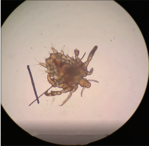
Video 1: Crab lice with three pairs of short and jointed legs.

a short, wide body with clawed legs except for the first pair, which is shortened and vestigial.