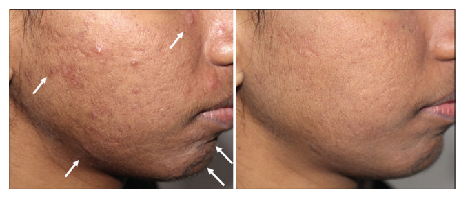
Figure 2: Before and after image showing improvement in scarring, treated by fractional Co2 laser plus 4% retinol peel and laser-assisted triamcinolone acetonide application for areas of hypertrophic and pre-keloidal scarring (arrows), 3 sessions done 2 months apart, in a patient on low-dose isotretinoin for acne management.