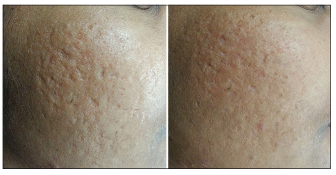
Figure 4: Before and after image showing improvement in acne scars, 4 weeks after a single session of radiofrequency needling.