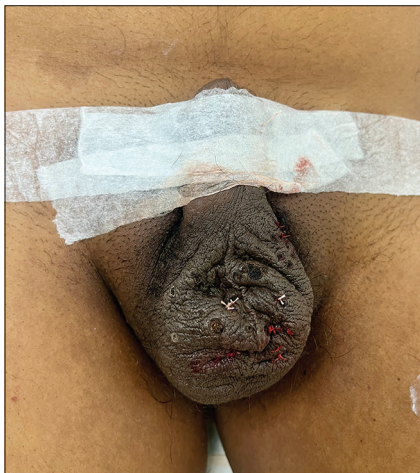
Figure 3: Image of the penoscrotal area with ventral penile taping in position, illustrating the effective execution of the procedure for idiopathic scrotal calcinosis.

from the operative field, ensuring unobstructed access to the scrotum. VPT eliminates the need for an assistant while maintaining a sterile and stable surgical environment.