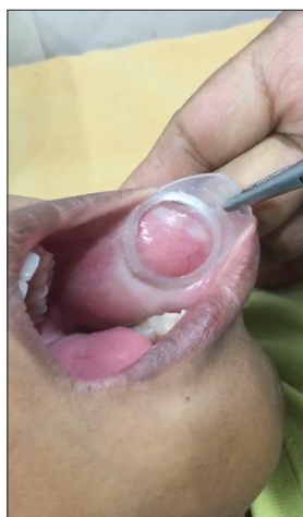
Video 1: The ring is used to examine the buccal mucosa.

sturdiness, strength, and flexibility, the holder or forceps angle can be adjusted during the examination and procedure to improve the field and hemostasis [Figure 2 and Video 1]. The size of the ring can be chosen based on the needs of the field. However, a smaller ring (5 or 10 mL syringe) has better annular occlusion ability, which can be useful in punch biopsy and granuloma pyogenicum procedures. This innovative ring is atraumatic, disposable, widely available, sterile, and inexpensive, making it simple to obtain during an inspection of mucosa and minor dermatosurgical procedures.