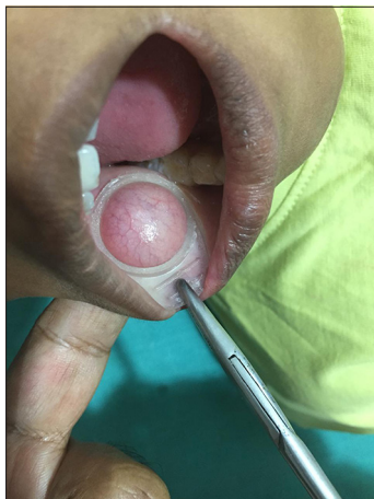
Figure 2: The ring is applied to normal buccal mucosa.