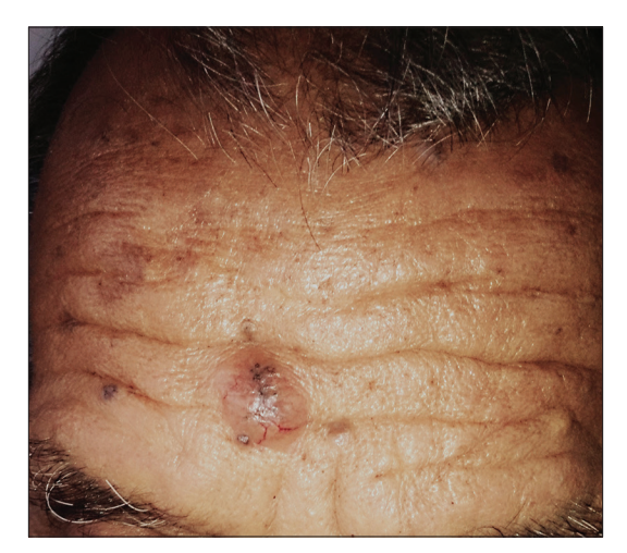
Figure 1: Well-defined skin colored nodule with telangiectasia on the forehead.

A 68-year-old male presented with a nodule on the forehead of seven months' duration. The lesion first started as a skin-colored papule, was tender, and attained the present size within a span of seven months. There was no history of ulceration. On examination, there was a welldefined skin-colored nodule of 2 \times 2.5 cm on the forehead above the right eyebrow [Figure 1]. The surface showed telangiectasia, and the nodule was tender on palpation. There was no regional lymphadenopathy. Dermoscopy showed red areas with dilated blood vessels. An excision biopsy was done. Biopsy showed the dermis to be packed with tumor cells arranged in sheets and nests and tubular lumina filled with colloid material. High power showed two types of cells: Small cells with clear cytoplasm and tiny basophilic nuclei [Figure 2] and fusiform cells with basophilic cytoplasm [Figure 3], diagnostic of nodular hidradenoma (NH). The NA also known as clear cell hidradenoma is a benign tumor of eccrine differentiation. The tumor most commonly affects the head and neck region and is sometimes a painful tumor. The tumor cells express epithelial membrane antigen and carcinoembryonic antigen. Malignant transformation is rare but can be aggressive. The NH is known for frequent recurrences; hence, wide excision is advocated.[1]