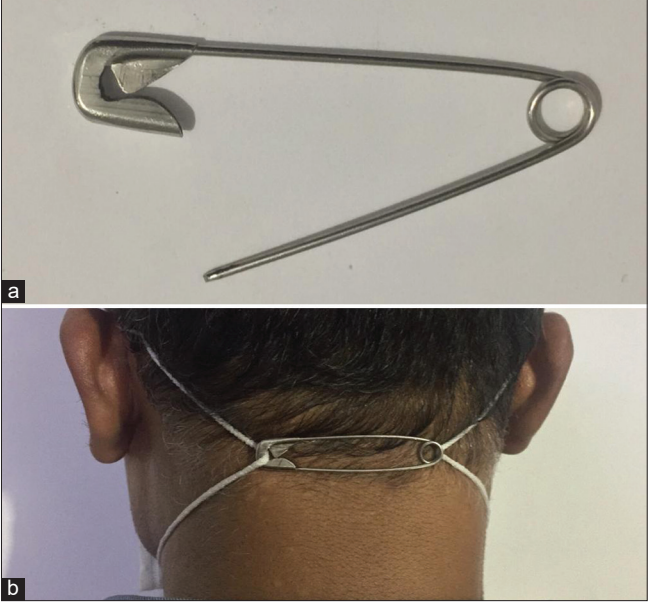
Figure 1: (a and b) The modified safety pin is used to reduce pressure of ear looped face mask on the pinna.

The pressure injury of elastic ear loops on the pinna (auricle) is inevitable in medical personnel due to long-term wearing of an ear-looped face mask. These elastics cause constant compression on the skin and the cartilage of the auricle, leading numbness, to erythematous and painful lesions. There are many devices or techniques, such as the wrapping of the ear loop on the spec and goggles handle, customized straw pipes, tourniquets, and serrated plastic bands that have been used to minimize the pressure on the pinna.<sup>[1-3]</sup> Here, a simple, readily available device, a safety pin, and a paper clip can be used to reduce the pressure of the ear loop of the mask on the pinna.