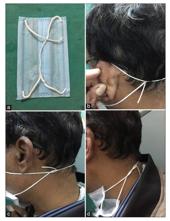
Figure 3: (a-d) The different stage of using ear loop of used face mask to reduce pressure on pinna.