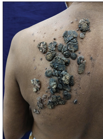
Figure 1: Multiple pigmented verrucous lesions over back.

A 70-year-old male presented with multiple raised lesions over the left side of the back for the past 2 years. Initially, the lesions were small to start with and gradually increased in size and number and attained the present size. There were no lesions elsewhere in the body including oral, nasal, and genital mucosa other than this site. He could not remember any history of trivial trauma. He had a habit of bathing in a common pool in his village. On dermatological examination, there were multiple verrucous and fragile exophytic growths of varying sizes over the left side of the back region unilaterally [Figure 1]. There were some skin-colored papules seen interspersed among them. These growths were crushed and examined under 10% potassium hydroxide [Figure 2]. It revealed multiple double-walled sporangia filled with sporangiospores suggestive of cutaneous rhinosporidiosis. Serology for human immunodeficiency virus 1 and 2 was done and turned non-reactive. Cutaneous rhinosporidiosis can present like