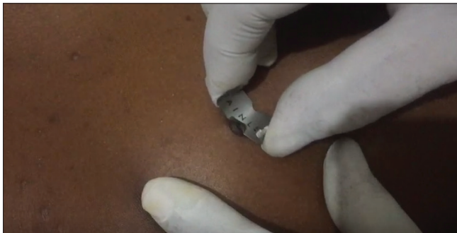
Video 1: The melanocytic nevus is being shaved with the blade.

we can get a cut on our finger during its procurement. The lateral cutting edge of this blade can be trimmed to prevent finger injuries.