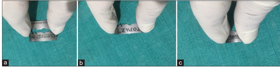
Figure 2: (a-c) The customized razor blades are held with fingers.