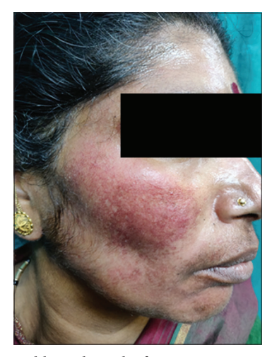
Figure 1: Rosacea like rash on the face.

Corticosteroids have also been found in various cosmetic skin whitening creams triggering dependence on them. Fairness mania induced by the topical steroids is a silent one. Some action is required to curb the sale and use of topical steroids.