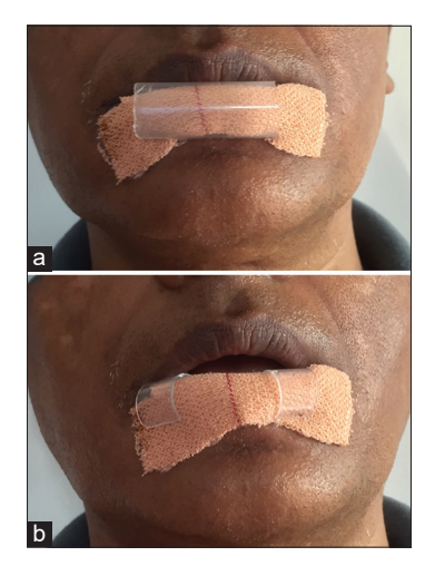
Figure 2: (a and b) The syringe barrel splints in place for retaining the graft and dressing over lip.

be removed for 5-10 min every 2-3 h. However, the barrel should remain in place during active lip movement, such