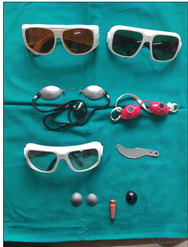
Figure 2: Different types of LASER safety eyewear.