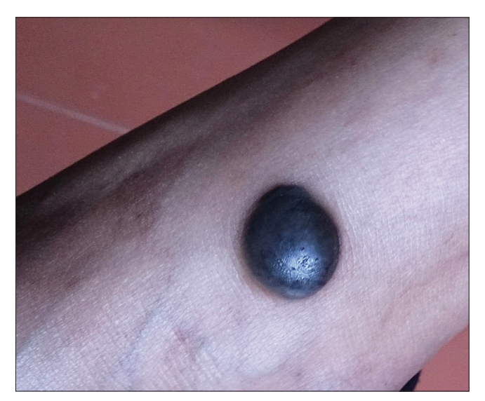
Figure 1: Well-defined hyperpigmented nodule on left ankle.

A 16-year-old female presented with a hyperpigmented nodule on the left ankle of one-year duration. The lesion first started as a small asymptomatic brownish-black papule, which later progressed to form the present size with increase in pigmentation. There was no history of any nevus at the site preceding the present lesion. On examination, there was a well-defined hyperpigmented nodule of 3 cm in diameter on the upper left ankle with the surface showing tiny pits [Figure 1]. Dimple sign was negative. Dermoscopy showed a central white area with a few blood vessels, which were nonspecific. An excision skin biopsy showed minimal epidermal changes while the dermis showed a grenz zone with the dermis packed with spindle-shaped histiocytes arranged in whorls and circles in a storiform pattern [Figure 2]. High-power (× 400) magnification showed multinucleate giant cells with blood vessels [Figure 3], all diagnostic of dermatofibroma. Dermatofibromas are benign tumors of the fibrous tissue and may mimic melanoma clinically. Cellular and aneurysmal types are the other histological variants.<sup>[1]</sup> Dermascopy is non-specific but may show central scar, shiny white lines, and atypical vessels.