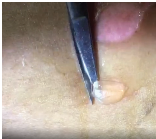
Video 2: The pedunculated blister graft is uncurled and anti-wrinkled from ventral surface of the graft.