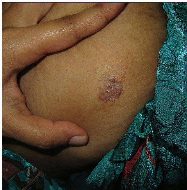
Figure 1: Solitary well-to-ill-defined skin-colored to reddish-brown plaque.

A 54-year-old female with skin phototype IV presented with 6 months history of a variable itchy skin lesion over the lower abdomen. Cutaneous examination revealed solitary well-to-ill-defined skin-colored to reddish-brown plaque (2 cm × 2 cm) with an uneven surface and surface erosion [Figure 1]. Differential diagnoses of sarcoidosis, lupus vulgaris, plaque-type granuloma annulare, and Bowen's disease were considered. Dermoscopy under non-polarized contact mode showed multiple tiny erosions, homogenous white to gray areas, brown dots (circumscribed, small, and round), blue-gray fine, and coarse peppering (non-circumscribed and not round), and focal clustered glomerular vessels [Figure 2]. After dermoscopic examination, a differential diagnosis of lichen planus-like keratosis (LPLK) was added. Histology revealed orthohyperkeratosis, focal mounds of parakeratosis, hypergranulosis,