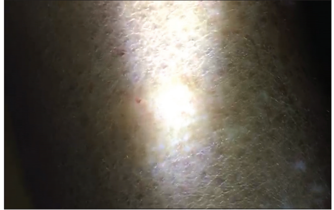
Video 1: The blade is being used to harvest ultrathin Thiersch's graft without local anaesthesia.