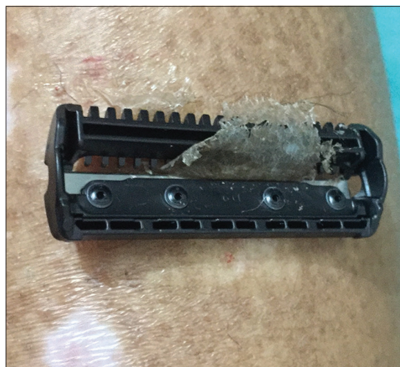
Figure 1: The Gillette guard-1 blade is used for harvesting the ultrathin Thiersch's graft.

We used the Gillette Guard-1 blade, which has one blade with a guard, to overcome the challenges of assembling the device and taking an ultrathin Thiersch's graft [Figure 1]. With the thumb and index finger, one can hold this blade with ease. The ultrathin Thiersch's graft is harvested with the blade in an aseptic environment without any modifications in the blade and help of assistant [Figure 2 and Video 1].