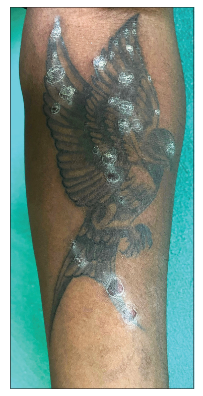
Figure 1: Scaly plaques of psoriasis confined only to the tattoo area.

A 32-year-old male with a history of scalp psoriasis on coal tar lotion, had undergone recently a tattoo procedure at a parlor. Two months later, the patient noticed scaly lesions at the site of the tattoo. On examination, there was a black tattoo of a bird on the left flexural aspect of the forearm studded with multiple plaques with silvery white scales confined only to the tattoo areas [Figure 1]. There were no similar skin lesions elsewhere on the body, and the patient did not have any scars elsewhere. There were no skin lesions elsewhere. Auspitz sign was positive. Skin biopsy showed bulbous acanthosis with spongiform pustule diagnostic of psoriasis. In tattooing,