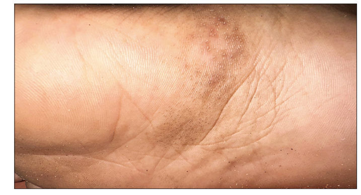
Figure 1: Multiple discrete and confluent hyperpigmented papules and pits on plantar region.

An 11-year-old boy presented with asymptomatic lesions on the right sole for 3 months. There was no preceding trauma. There was a negative history of topical application. On examination, there were multiple discrete and confluent hyperpigmented and skin-colored pin-point papules with pits on the plantar crease extending from the medial aspect of the right plantar region to the midline just below the forefoot [Figure 1]. Pitted keratolysis and plantar punctuate warts were the differentials considered. Skin biopsy from the plantar lesion revealed a mononuclear infiltrate just below the epidermis with the rete pegs "clutching" the infiltrate resembling a "claw clutching a ball," diagnostic of lichen nitidus [Figure 2]. The patient was treated with clobetasol–salicylic acid