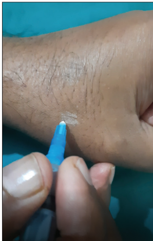
Video 2: A broken or cut needle (21-23G) with its hub can be used for focal curettage and dermabrasion.