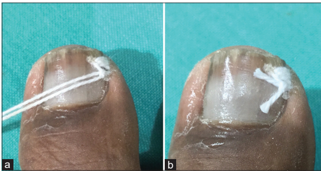
Figure 3: (a and b) The pierced ingrown nail is sealed with soft cotton thread using suture needle.

upward pressure without untoward pressure on nail bed and its gutter. Thus, the ingrown nail is isolated from its