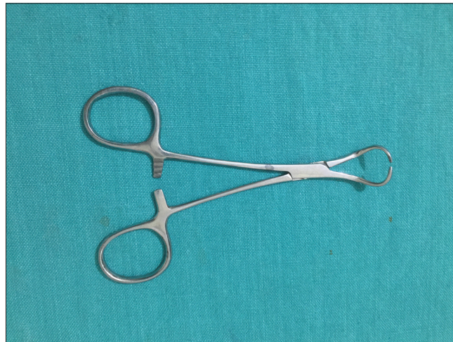
Figure 1: The Backhaus towel clip used for piercing and everting ingrown nail plate.

Under asepsis without local anesthesia, the distal free part of lateral nail plate without nail bed tissue is secured with towel clip [Figure 1]. After locking the clip, the nail plate gets pierced [Figure 2a]. Following this, isolation of the ingrown nail plate is done with outward and