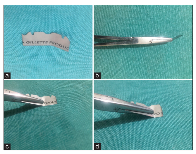
Figure 1: (a-d) A halved angulated razor blade is being procured having different size of cutting edge.

To overcome challenges, we employed a needle holder and a halved, angulated small razor blade. A razor blade is first cut in half lengthwise. The needle holder is then used to break both sides of the blade. Following that, the blade is held and bent by 30–45° with the needle holder after leaving the required cutting edge size based on the dimensions of the lesion [Figure 1a-d]. This blade offers