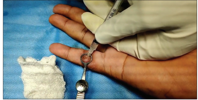
Video 1: Sclerotherapy is being performed over the finger while holding it using a chalazion clamp, to prevent dissipation of a sclerosing agent.

Patients' consent not required as patients' identity is not disclosed or compromised.