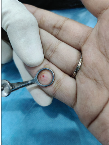
Figure 2: Post-paring image of verruca over a finger, held by chalazion clamp.

firm immobile surface and protruding the central core of corn and the deeper part of callosity and verruca by compressing the center of the lesion. This made the procedure quite convenient, fast, and easy.