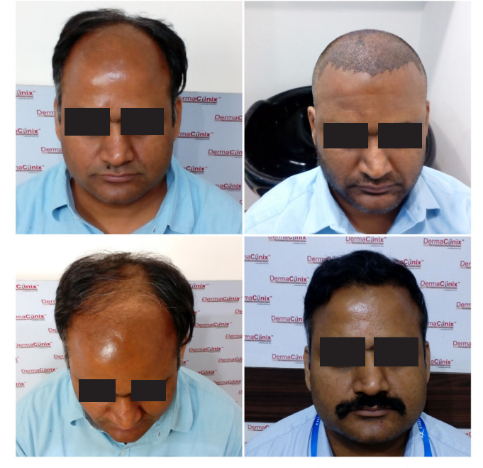
Figure 8: Postoperative results in a case of FUE with direct hair transplantation.

Graft survival rate is dependent on the temperature of holding solution, out of body time, minimal handling of the grafts, and the use of biostimulus. Chilled normal saline (1-4^{\circ}C) is a better holding medium for graft survival as compared to normal saline.<sup>[29,30]</sup> Reasons for graft desiccation is due to dehydration, transection, blunt trauma, and ischemia