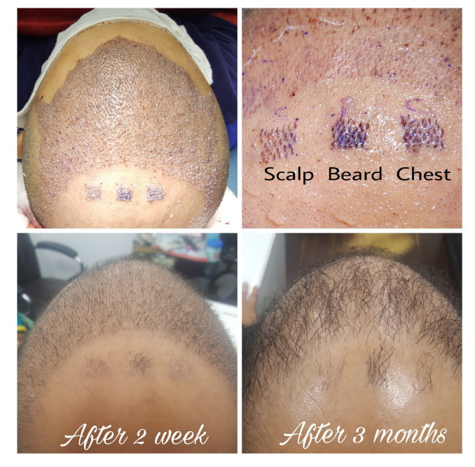
Figure 7: Comparing the results of scalp hair versus non-scalp hair in terms of results and survival of grafts in follicular unit extraction (FUE).

FUE procedure involves three main steps: Graft extraction, followed by creation of recipient area, and then graft implantation,<sup>[27]</sup> However, DHT technique, involves a few changes in the above sequence of events. The recipient area slits are created initially, followed by graft extraction and simultaneous implantation. The first step, is called "scoring" which involves, making the skin incision using a punch, inside the skin up to 2.5–3 mm. In the next step, grafts that were scored are extracted using forceps. While the process of scoring is going on, simultaneous graft extraction and implantation follows subsequently. After scoring few grafts