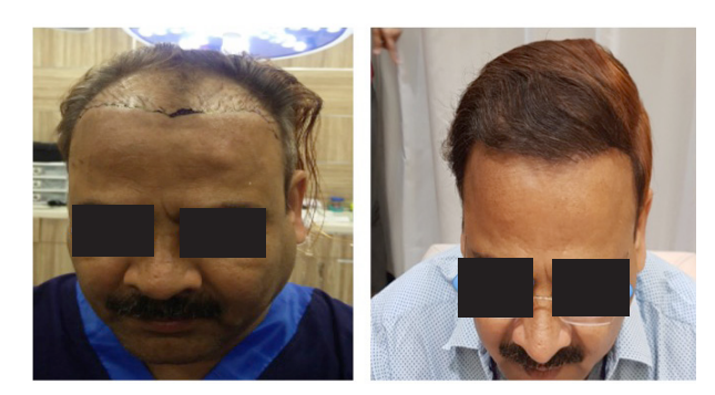
Figure 1: "Doll's look" appearance seen with punch grafting.

and follicular unit extraction (FUE) techniques<sup>[4]</sup> of hair transplantation. Automated FUE technique in turn overcame the limitations of old school FUE and it is now possible to achieve more than a thousand grafts in one day in trained hands. In 2006, an innovative method called the surgically advanced follicular extraction (SAFE) system was introduced by Dr. Harris,<sup>[5]</sup> with extremely low transaction rates of an average 6.14%.