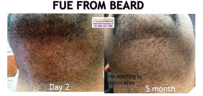
Figure 6: Beard as a donor area in follicular unit extraction (FUE).

FUE is the preferred technique of choice in patients with depleted scalp donor area and advanced androgenetic alopecia. Nevertheless, despite advancements in FUE not much data have been published comparing the results of scalp hair with non-scalp hair in terms of results and survival of grafts. A study conducted to compare scalp hair versus non-scalp hair used as donor in hair transplant surgery, showed a graft survival rate of 95%, 89%, and 76% respectively with beard, scalp, and chest hairs after 1 year of hair transplant [Figure 7].<sup>[25,26]</sup>