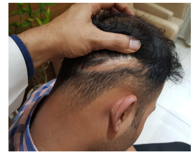
Figure 2: Linear scar visible in the donor area with follicular unit transplantation (FUT).

This method involves single strip donor harvesting taken from the donor area via an elliptical excision, followed by suturing. Although with the newly described trichophytic closure, it is possible to reduce the visibility of the scar;<sup>[6,7]</sup> however, it still poses a cosmetic problem for patients who wish to wear short hair [Figure 2].<sup>[8,9]</sup> FUT has many other disadvantages such as being labor intensive and time consuming. Due to these reasons, FUT is preferred in certain specific conditions and FUE has become more popular in today's era.