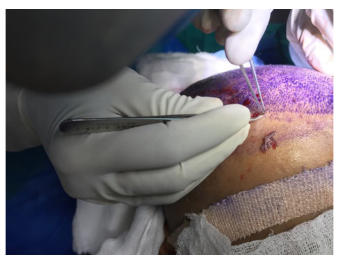
Figure 9: Implantation of follicular units using fine angled forceps.

Choi et al. <sup>[35]</sup> devised an alternative approach for speeding up the transplantation process. The follicular units need to be carefully prepared, and are implanted using an implantation device. The "Choi Implanter" is an effective device into which