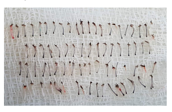
Figure 4: Single follicular units post extraction from beard donor area.

The major advantage of FUE is that it permits the use of beard and body hair which is essential in advanced cases of baldness with limited scalp donor area.<sup>[18]</sup> Even patients who have already undergone a previous surgery and have exhausted their available donor area, can achieve satisfactory results. However, body and beard hair characteristics such as thickness, length, and hair cycle are quite different from scalp hair [Figures 4 and 5][Table 2].<sup>[19]</sup>