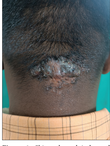
Figure 1: Skin coloured inducated plaque of size 3 \times 4 cm in the nape of the neck with multiple papules along its margin and scarring alopecia.

A 40-year-old male presented with asymptomatic raised lesion over the nape of the neck for 1 year. On examination, skin colored indurated plaque of size 3 \times 4 cm is present over the nape of the neck with multiple tiny papules along the margin of the plaque with scarring alopecia [Figure 1]. Based on the history and clinical examination, a diagnosis of acne keloidalis nuchae was made. The lesion responded to intralesional triamcinolone injection 10 mg/mL over three sessions given monthly. Acne keloidalis nuchae is a type of chronic folliculitis characterized by papules and pustules in the nuchal and occipital region. Clinically, it can resemble keloid in the later stages, by histologically, it shows perifollicular inflammation with lymphocytes and plasma cells at the level of isthmus and lower infundibulum. It lacks the histological features of keloid.