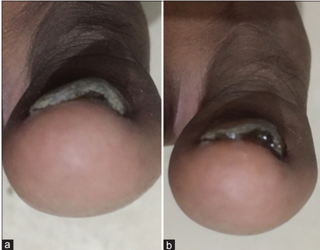
Figure 2: (a and b) Onycholytic space of toenail is sealed with the glue.

easily controlled by applying pressure with two fingers to the container. After use, the applicator's residual glue is withdrawn into the container and the device's outlet is firmly capped with a hypodermic needle cap [Figure 1a-c]. If the micropipette tip becomes clogged, a new one can be used. This customized applicator may be used for precise glue application [Figure 2a and b]. As a result, the micropipette-tipped glue device is a low-cost and effective instrument for accurate glue application. In place of micropipette tip, a hypodermic injection needle with or without cutting its tip, can be mounted over the glue container.