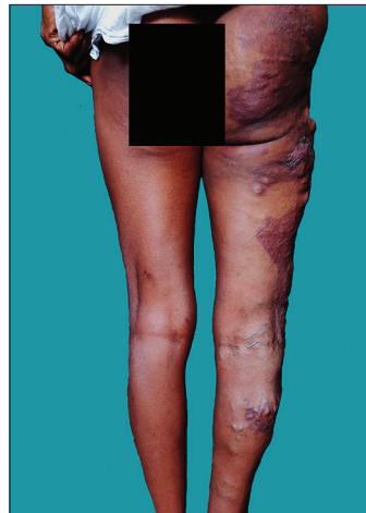
Figure 1: Non-blanchable dull erythematous stain with a geographical margin noted extending from the right buttock to the right midcalf. Dilated and tortuous veins were noted over the right buttock and posterolateral thigh extending to the leg.

A 29-year-old female presented to the dermatology outpatient department with a reddish stain over her right buttock, thigh, and leg since birth. The patient started developing nodularity around the stain during early childhood. She had intermittent pain over the stain and nodular areas. On cutaneous examination, limb length abnormality was present with a longer right limb than the left. The right thigh, leg, and foot girth were higher than the left side. Non-blanchable dull erythematous stain with a geographical margin extending from the right buttock to the right midcalf was present [Figure 1]. Grouped papules and vesicles with frog spawn appearance were present over the right buttock. Dilated and tortuous veins were noted over the right buttock, posterolateral thigh, and leg, extending to the right foot's dorsal aspect [Figures 1 and 2]. Patients had no other comorbidities. Genetic testing was not done as the facility for it was not available. Thus, a diagnosis of Klippel–Trenaunay syndrome (KTS) was made based on history and clinical