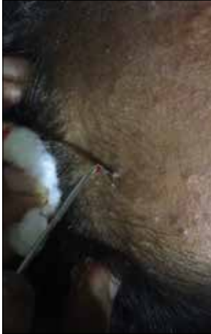
Video 2: The pickaxe hypodermic needle is used to prick and extract the comedone.

plane, mark the needle's hub. As a result, the modified pickaxe or marked needle may be used for simple prick incision without trouble or confusion [Figure 1a and b].