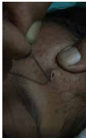
Video 1: The pickaxe hypodermic needle is used for prick incision over comedone.

The tip and its beveled edge are bent, to ensure the prick incision is in a vertical plane. The bent in the needle is made with a needle holder. It now resembles a pickaxe needle after being modified. Comedones may be easily pierced and incised with this needle by drawing it up and forward [Videos 1 and 2]. As an alternative, after positioning the beveled edge in the vertical position