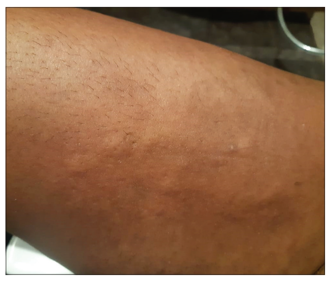
Figure 1: Clinical photograph of 30-year-old male with urticarial wheals over medial aspect of the right thigh.

Histopathological examination revealed eosinophilic spongiosis, dense eosinophilic infiltration in perivascular region, and interstitial dermis extending up to the subcutaneous tissue. Several flame figures (collagen fibrils coated with eosinophilic granule proteins) were visualized [Figure 3].