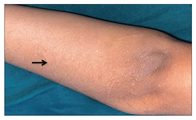
Figure 1: Multiple shiny flat-topped hypopigmented to mildly violaceous papules few present in linear pattern exhibiting Koebner (black arrow) phenomenon over upper limbs, trunk, and neck.

Treatment options include topical corticosteroids; topical calcineurin inhibitors may be prescribed to reduce inflammation and itching. Phototherapy and oral medications such as