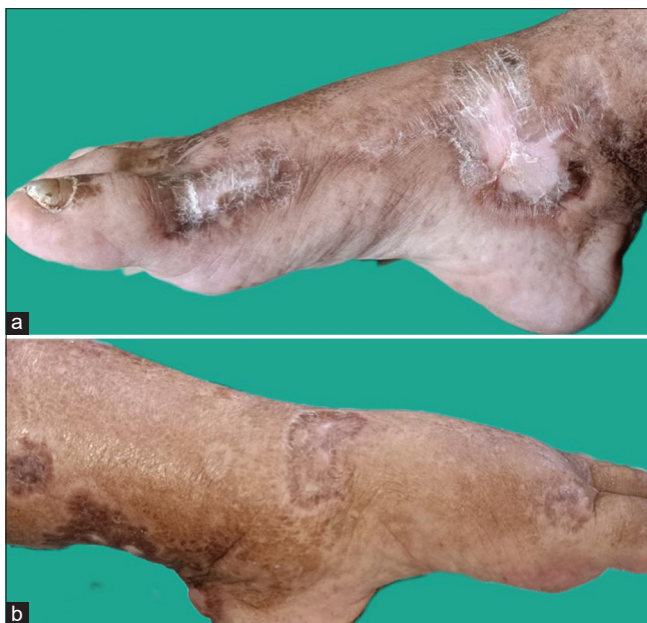
Figure 3: (a and b) Lesions healed with cribriform scarring over left and right leg.

criteria created following a Delphi consensus exercise using the RAND/UCLA Appropriateness method, [9] our patient fulfilled one major criterion and seven minor criteria [Table 1].