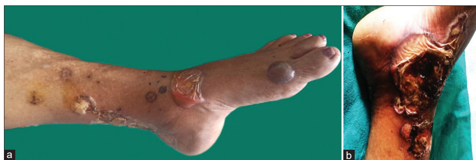
Figure 1: (a and b) Multiple variable sized ulcers and hemorrhagic bullae over legs.

The PG was first described by Brunsting et al. in 1930 as a rare, neutrophilic ulcerative disorder of the skin. [2] The incidence is thought to be approximately 0.63/100,000 with the median age, at presentation, of 59 years. [3] The sex incidence ranges from being equal, to females being predominantly affected in up to 76% of cases. [4] Most cases are of classic ulcerative type (approximately 85%), other subtypes include bullous, vegetative, pustular, peristomal, and superficial granulomatous variants with subtypes sometimes transitioning from one form to another. [5] Bullous PG was initially described by Perry and Winkelmann in 1972. [6] This type is characterized by painful