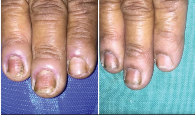
Video 1: Video showing procedural details.