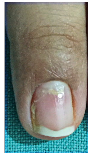
Figure 2: Fingernail showing regeneration of cuticle and gap between proximal nail fold and nail plate is obliterated (Remnants of glue can also be seen).

This is an open-access article distributed under the terms of the Creative Commons Attribution-Non Commercial-Share Alike 4.0 License, which allows others to remix, transform, and build upon the work non-commercially, as long as the author is credited and the new creations are licensed under the identical terms.