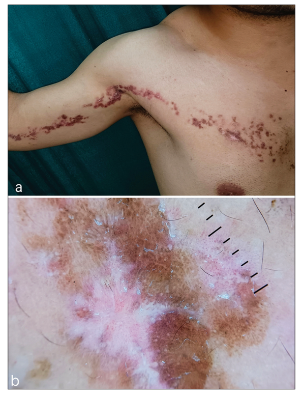
Figure 1: (a) A linear violaceous to brownish plaque with few discrete papules in a blaschkoid pattern extending from the right side of the anterior aspect of the chest to the right arm with an erythematous background and overlying whitish scaling at a few places. (b) Dermoscopic examination showing reticulate whitish structures, white scales and dotted vessels (DL4,10X).

A 28-year-old male student with no comorbidities presented to the dermatology outpatient department with the complaint of pruritic eruptions for the past 4 months over the right arm and extending over the chest. Negative history included no history of travel, recent immunizations, herpes infections, or any significant medication history. On examination, a linear plaque extended