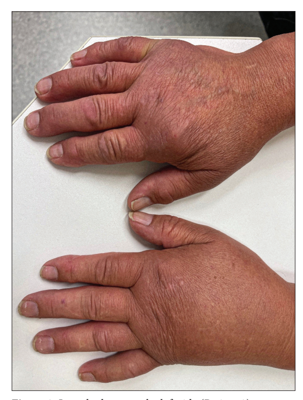
Figure 3: Lymphedema on the left side (Patient 2).

On examination, the complete left arm showed swelling without color changes [Figure 3]. On palpation, the skin