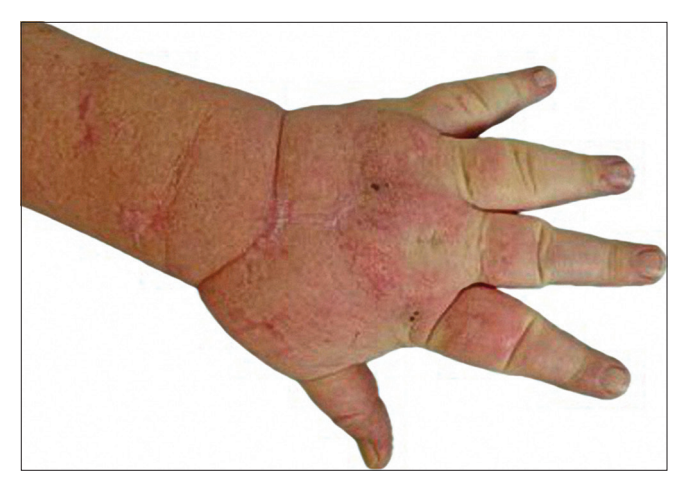
Figure 1: Lymphedema (Patient 1).