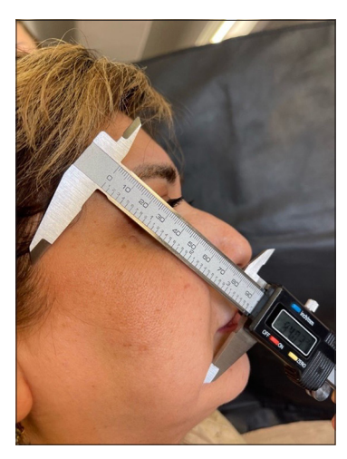
Figure 1: Thread implantation trajectory measurement method on patient.