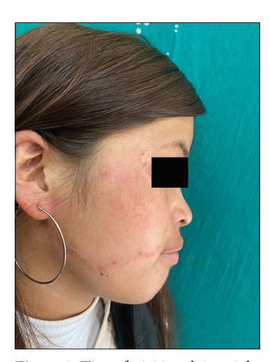
Figure 3: Tinea faciei involving right side of face.