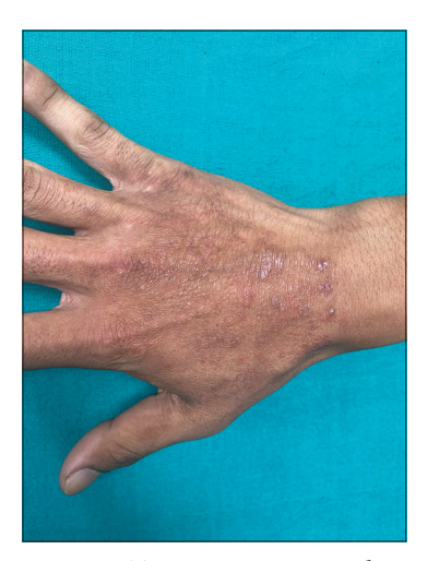
Figure 5: Tinea manuum extending to involve the dorsum of hand.