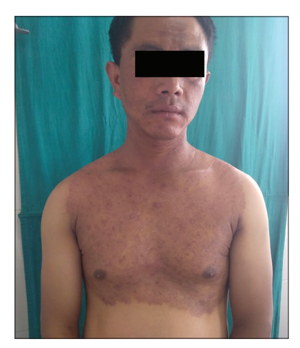
Figure 2: Tinea corporis with faciei.