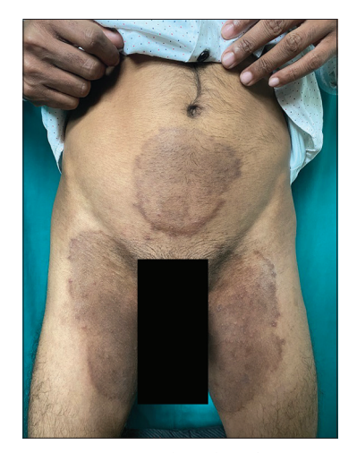
Figure 1: Combined infection tinea corporis with cruris.