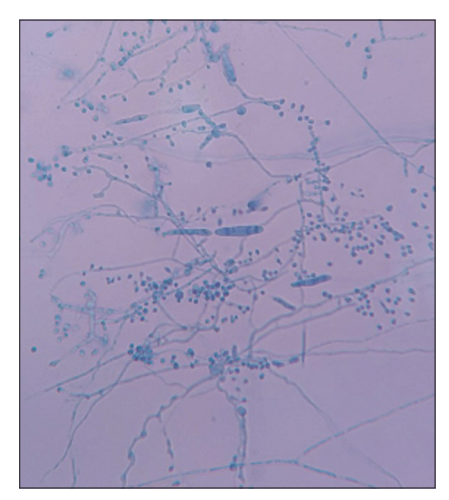
Figure 6: Lactophenol cotton blue mount showing macroconidia and microconidia of dermatophytes.