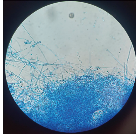
Figure 4: Microscopy of lactophenol cotton blue mount from the culture on Sabouraud dextrose agar at 25° C showing spiral hyphae ( \times 100 ).

Kerion, an inflammatory tinea capitis, presents as boggy, tender nodules with pustules, scaling, alopecia, and regional lymphadenopathy, mostly in children. Common causative agents include Trichophyton tonsurans and Microsporum canis , with T. mentagrophytes being uncommon. [1] Diagnosis involves