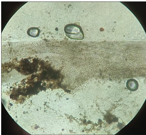
Figure 3: Microscopy of potassium hydroxide mount of a plucked hair showing intrapillary arthroconidia ( \times 400 ).

on oral griseofulvin microsize suspension at a dose of 20 mg/kg for 6 weeks. However, the response to therapy could not be assessed as the patient was lost to follow-up.