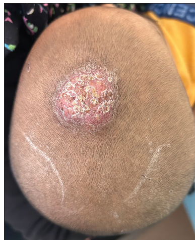
Figure 1: Single, well-defined, erythematous nodular swelling over the mid-frontal scalp measuring 4 × 4 cm, with multiple follicular pustules, semi-adherent yellowish-white crusts, peripheral white scales, and overlying alopecia.

A 6-year-old boy presented with a single painful boggy swelling with overlying hair loss on the scalp for two weeks. On examination, there was a single, well-defined, erythematous, fluctuant nodular swelling over the mid-frontal scalp measuring 4 × 4 cm, with multiple follicular pustules, semi-adherent yellowish-white crusts, peripheral white scales, and overlying alopecia [Figure 1] without any regional lymphadenopathy. Trichoscopy revealed multiple yellow globules, few pigtail, corkscrew as well as morse code hair, and black dots along with hemorrhage [Figure 2], over a background of erythema. Microscopy of potassium hydroxide (KOH) mount of a plucked hair revealed intrapillary arthroconidia [Figure 3]. Trichophyton mentagrophytes complex was isolated on culture in Sabouraud dextrose agar at 25° C. Lactophenol cotton blue mount from the culture showed spiral hyphae [Figure 4]. Based on the clinical, trichoscopic, and microscopy features, a diagnosis of kerion caused by T. mentagrophytes was made and the patient was started