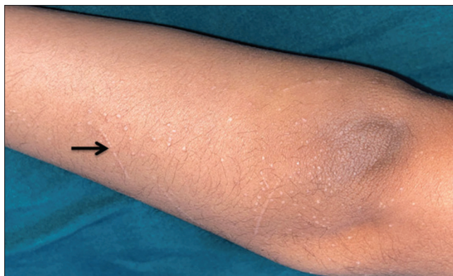
Figure 1: Multiple shiny flat-topped hypopigmented to mildly violaceous papules few present in linear pattern exhibiting Koebner (black arrow) phenomenon over upper limbs, trunk, and neck.

Treatment options include topical corticosteroids; topical calcineurin inhibitors may be prescribed to reduce inflammation and itching. Phototherapy and oral medications such as