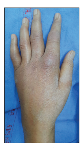
Figure 2: Erythematous swelling over second right MCP joint with yellowishwhite nodules inside it (nodules are not clear in picture).

Gout is a common systemic metabolic disorder caused by abnormal uric acid metabolism. Untreated gouty arthritis can result in intra-dermal and deeper deposition of monosodium