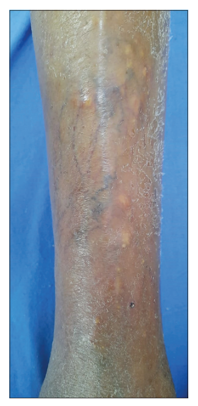
Figure 1: Multiple hard, yellowishwhite discrete, non-tender, and papules over normal to erythematous appearing skin over shin.