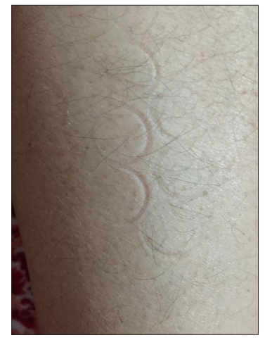
Figure 2: Measurement of skin with rim of a suction device used.