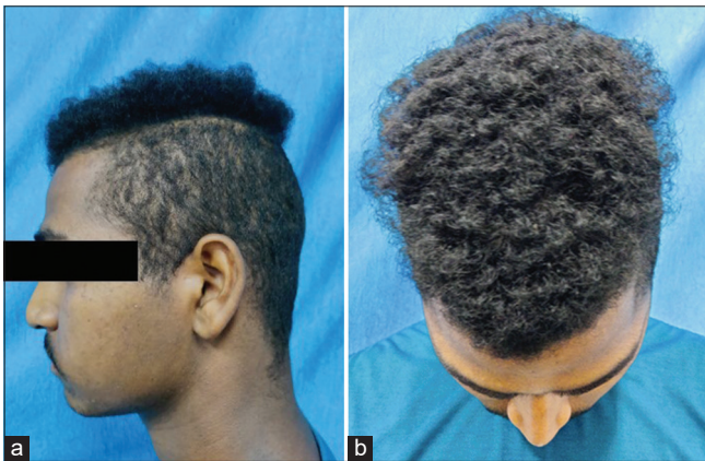
Figure 3: (a and b) Curly coarse hairs suggestive of woolly hair (lateral view).

cardiomyopathy. [2] In India, there are very few case reports on Naxos disease, which comes in view when the patient comes with recurrent syncope or rhythm abnormalities, so regular monitoring is required.