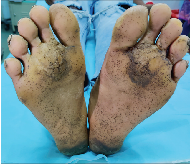
Figure 2: Plantar keratoderma with pitted keratolysis.