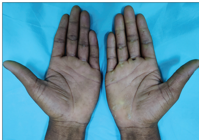
Figure 1: Palmar keratoderma with callosities.

PPK is a heterogeneous group of genodermatosis, with hyperkeratosis of palms and soles. They are classified according to either their morphology (diffuse, focal, and punctate), mode of inheritance (autosomal dominant and autosomal recessive), and presence or absence of extracutaneous features. The classical clinical presentation of PPK, right ventricular cardiomyopathy, and woolly hair establishes the diagnosis of diffuse inherited PPK with extracutaneous features, most likely of Naxos disease, caused by mutation in plakoglobin gene. Therefore, whenever woolly hair presented with associated PPK, search for possible cardiac abnormalities is recommended, and regular follow-up is required. [1] Naxos disease is a rare genodermatosis with woolly hair, PPK, and